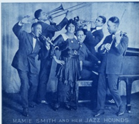
MAMIE SMITH AND HER JAZZ HOUNDS

Get this number for your phonograph on Okeh Record No. 4169