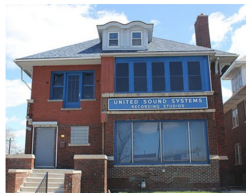
A special ARSC Virtual Conference keynote presentation on United Sound Systems is scheduled for May 20.