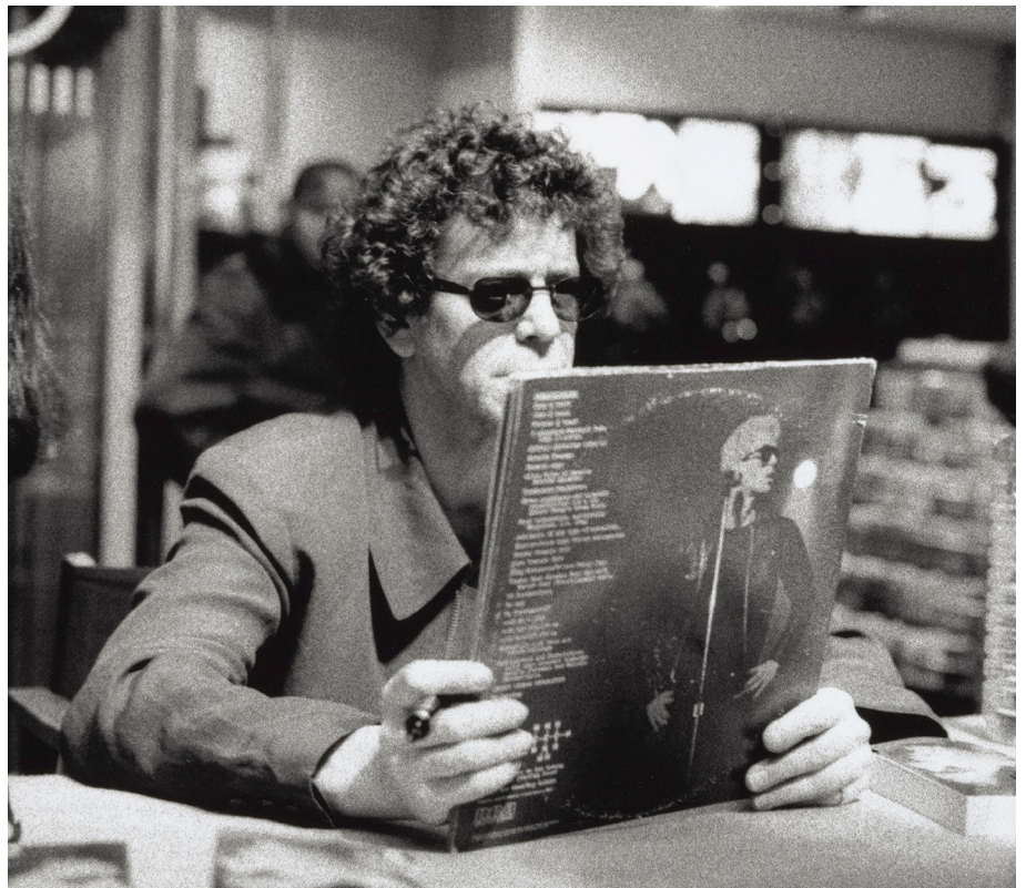
Lou Reed holding a copy of Metal Machine Music at an in-store signing in Paris, September 19, 1996.

From June 9, 2022 through March 4, 2023, the Music & Recorded Sound Division at the New York Public Library for the Performing Arts will be hosting a free exhibition entitled “Lou Reed: Caught Between the Twisted Stars.”